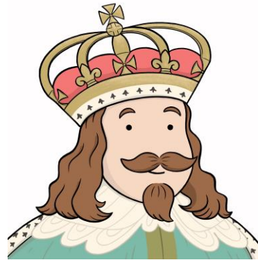
King Charles I

Believed in the Divine Right of Kings and was executed in 1649.