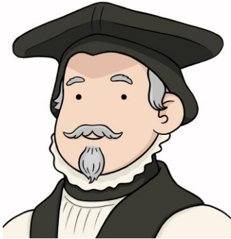
Archbishop William Laud

Responsible for religious reforms that were viewed as too Catholic.