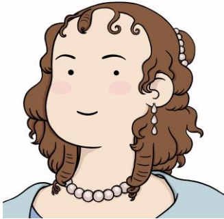
Queen Henrietta Maria

Married to King Charles I and disliked by many because she was Catholic.