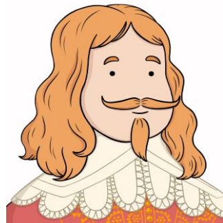
Sir Alexander Leslie

A Scottish General who led a Scottish invasion into England in 1644.