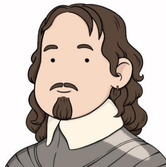
Sir Thomas Fairfax

A Parliamentary Commander who was seriously injured when a musket ball hit his shoulder.